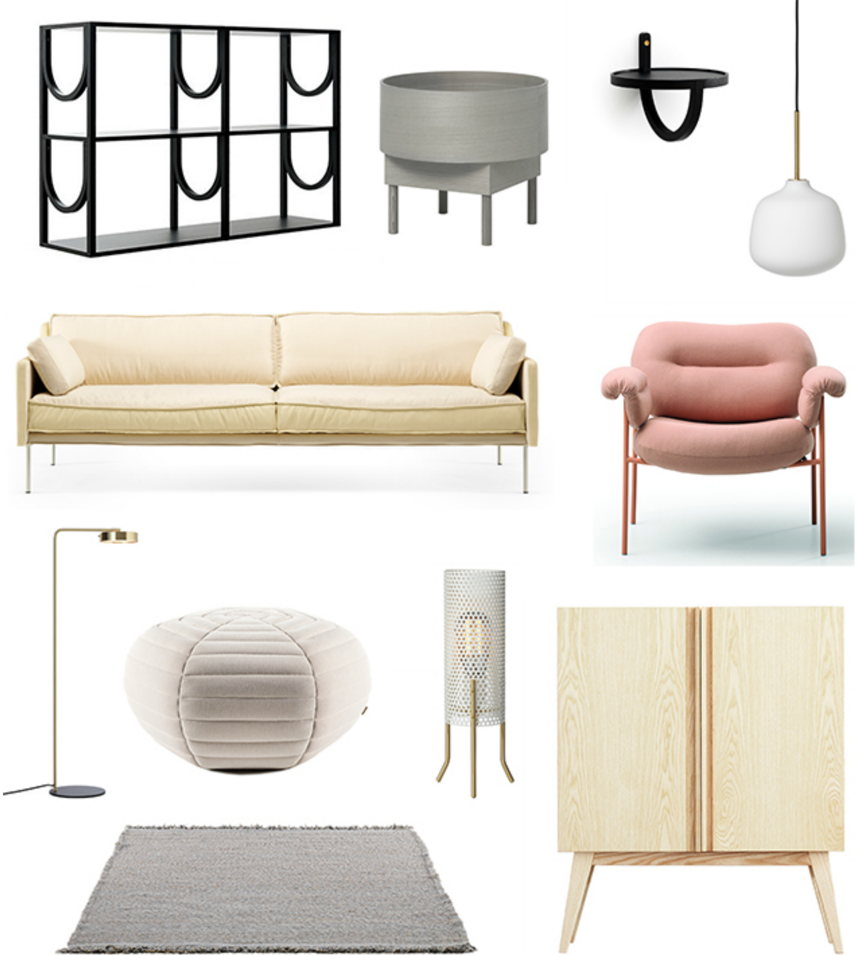
Arch Shelf by Fogia, Bowl Storage Unit (grey ash) by Fogia, Archetto Shelf by Fogia, Holborn Pendant by Rubn Lighting, Bollo Chair by Fogia, Boss Cabinet by Fogia, Vogue Tripod Table Lamp by Rubn Lighting, Ropemaker Rug by Fogia, Poppy Pouf by Fogia, James Floor Lamp by Rubn Lighting, Dini Sofa by Fogia

To see the entire collection of Fogia and Rubn Lighting , visit Fred International . and if you're in Melbourne be sure to visit the stand at Denfair .